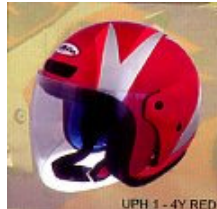
UPH 1 - 4Y RED