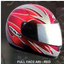
FULL FACE ARI - RED