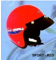
SPORT - RED