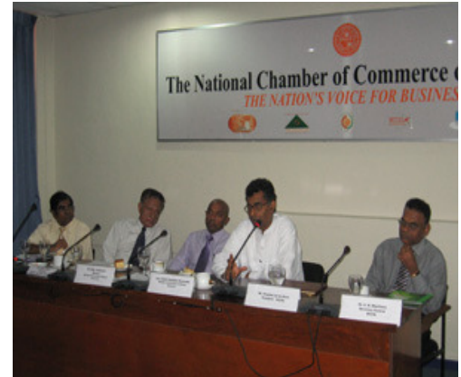
Picture shows the Hon. Minister addressing the gathering with the Chamber council members looking on

would lead to extinction of the human race if no action is taken to cut down the emissions drastically. Hon minister also said that the government has taken many steps to encourage the private sector to invest on environment friendly projects and requested the Chamber members to make use of such facilities for the betterment of our future generations.